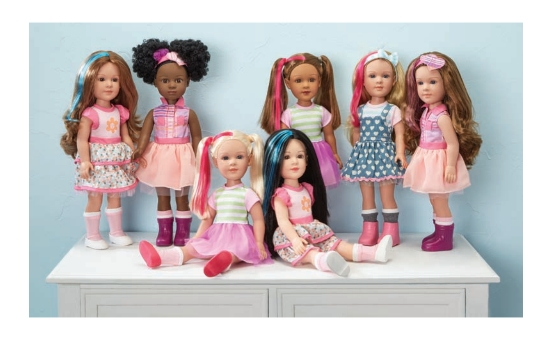
A New! Kindness Club - Rosa Medium Skin Tone/Brown Eyes/Brunette Hair 14" Tall • Age 3 + • Style # 20216

Meet the Kindness Club<sup>®</sup>, girls with big hearts and big dreams to make the world a better place, teaching caring and respect for all people. These 14" dolls have molded, poseable bodies, realistic fixed eyes, engaging outfits, and beautiful rooted hair with a colorful highlight!