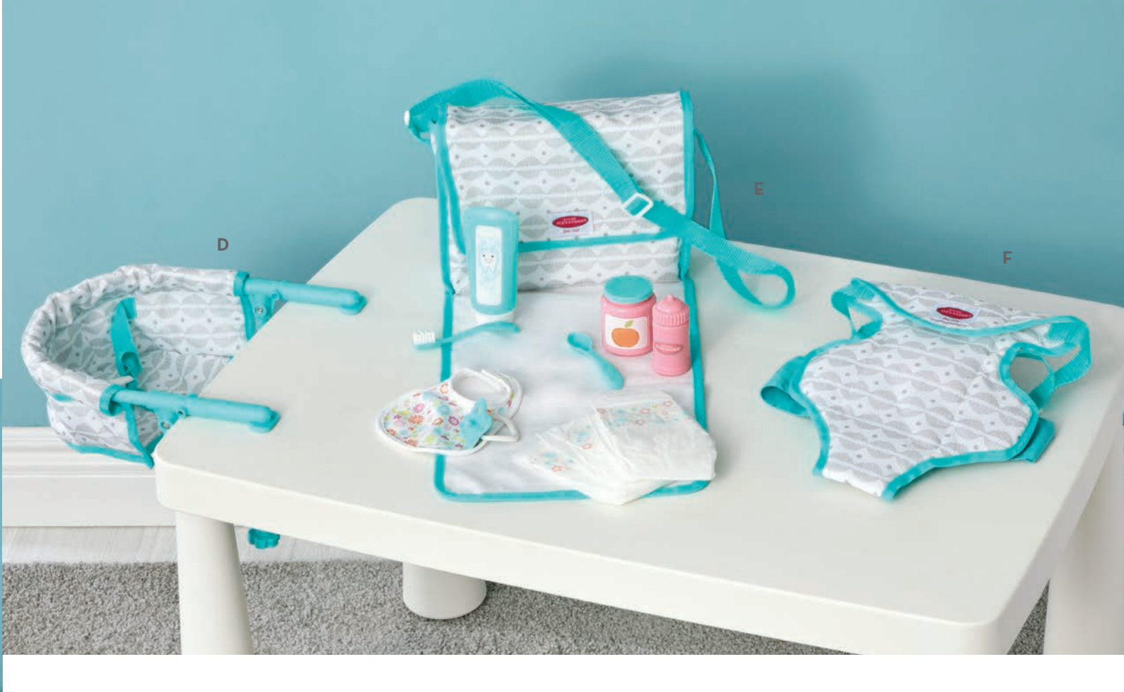
A. Soft Gray Pack and Play Age 2+ • Style # 20378

B. Soft Gray Car Seat/Carrier Age 2+ • Style # 20377