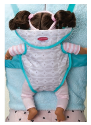
Baby can ride in front or back!